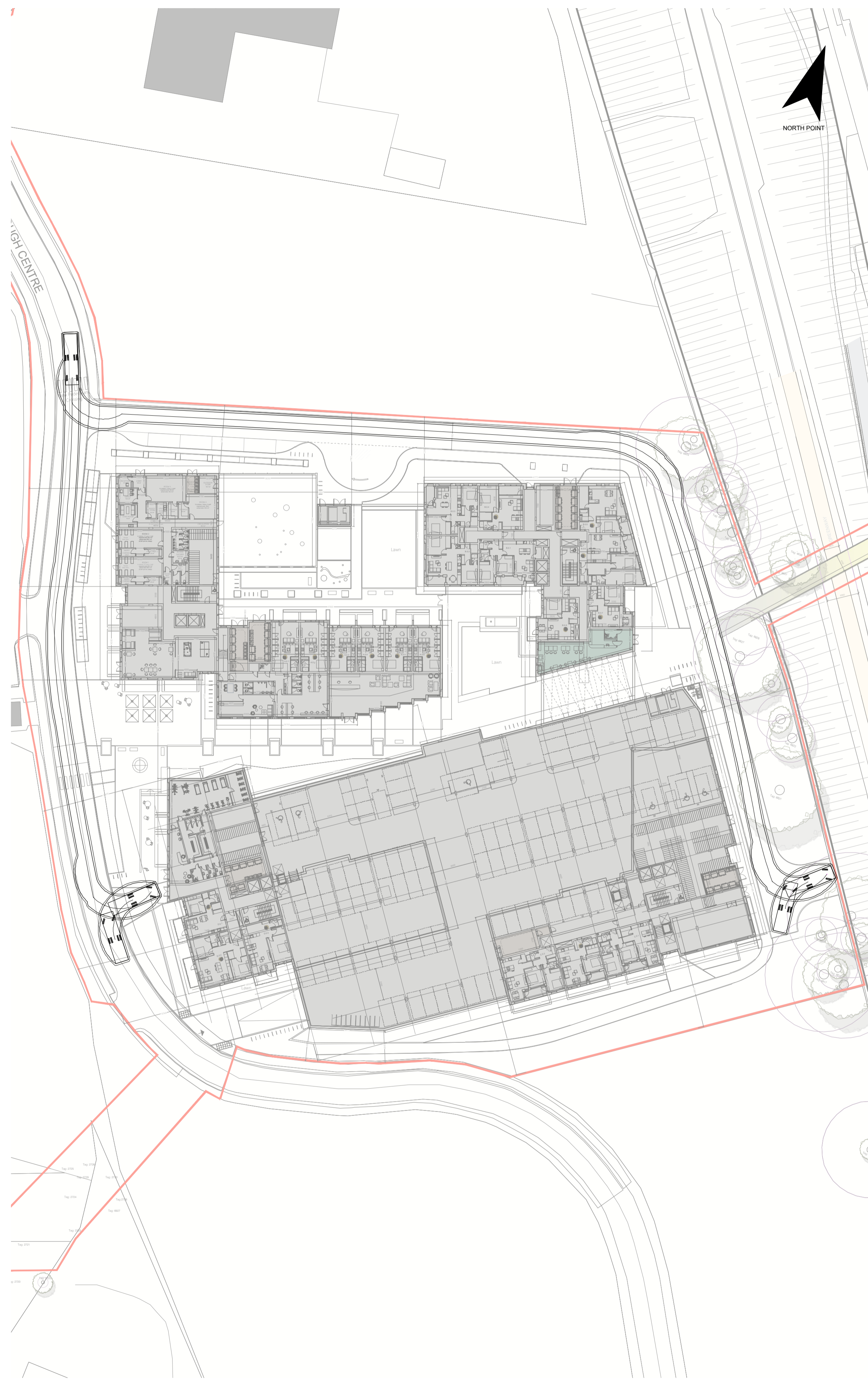
1 GROUND FLOOR PLAN - FIRE TENDER SITE ENTRY SCALE 1:500